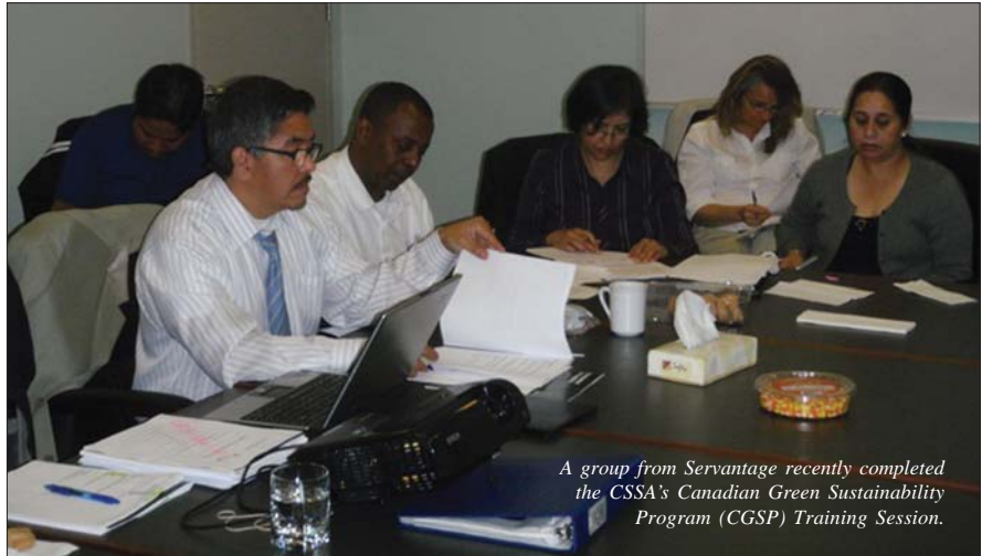
A group from Servantage recently completed the CSSA's Canadian Green Sustainability Program (CGSP) Training Session.