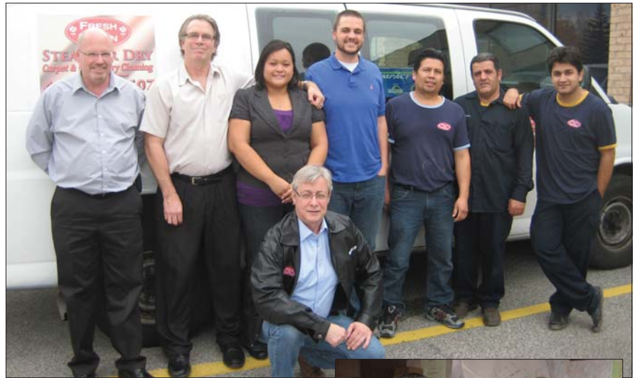
(Above) Fresh and Clean Carpet and Upholstery Cleaning was the Canadian Green Sustainability Program's first certified contractor.